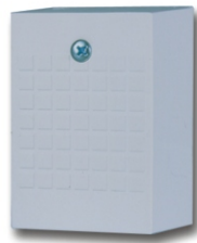
12v AC Power Supply