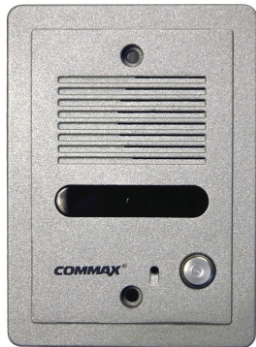
Vandal Resistant Door Panel