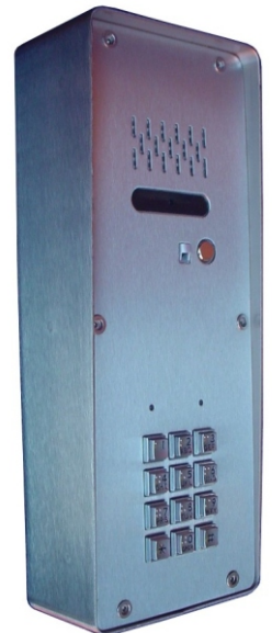
Example of stainless surface panel with integral keypad